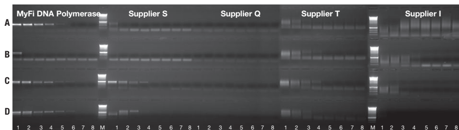
Fig. 2 Greater reliability with GC-rich DNA

An advanced buffer system and enzyme blend combine to give increased target affinity, ideal for amplification of cDNA libraries, complex genomic fragments (Fig.1) and GC-rich targets (Fig. 2).