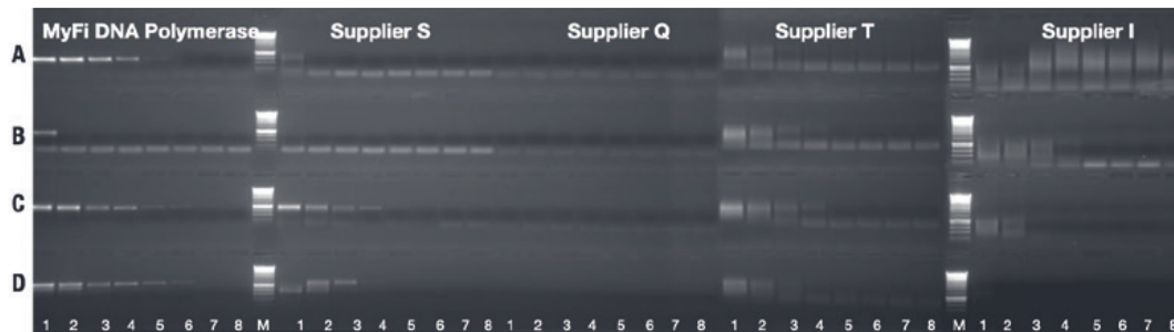
Fig. 2 Greater reliability with GC-rich DNA A 3.9 kb (A) fragment of \alpha -1-antitrypsin (AT-R3) gene, a 7 kb (B), a 9 kb (C) and a 10 kb (D) fragment (respectively) of human ( \beta -globin) HbG gene, were amplified using MyFi DNA Polymerase and the results were compared with amplifications using high-fidelity hot-start DNA Polymerases from other suppliers. A 5-fold serial dilution of human genomic DNA (5 ng - 0.32 pg, lanes 1-8 respectively, HyperLadder 1kb (M)), was amplified according to the manufacturers' protocol. The results illustrate that MyFi out-performed high-fidelity polymerases for complex human genomic DNA assays.

An advanced buffer system and enzyme blend combine to give increased target affinity, ideal for amplification of cDNA libraries, complex genomic fragments (Fig.1) and GC-rich targets (Fig. 2).